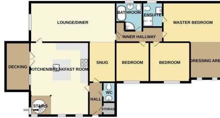
TOTAL FLOOR AREA: 1917 sq.ft. (178.1 sq.m.) approx. Whilst every attempt has been made to ensure the accuracy of the floorplan contained herein, measurements of doors, windows, rooms and any other items are approximate and no responsibility is taken for any error, omission or mis-measurement. This plan is for illustrative purposes only and should be used as such by any prospective purchaser. The services, systems and appliances shown have not been tested and no guarantee is given as to their operability or efficiency can be given. Made with Metapix 03/2021